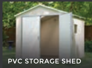
PVC STORAGE SHED