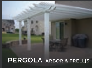
PERGOLA ARBOR & TRELLIS